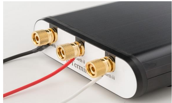
Three Earth Terminals